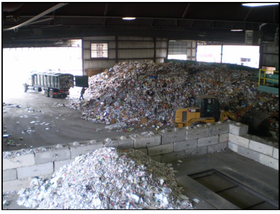
Recyclable materials are dropped off at the facility in a single-stream, meaning the materials do not have to be separated to be processed.

All recyclable materials picked up curbside from Apex residents go to a material recovery facility in Raleigh operated by Sonoco Recycling, Inc. The facility is a 75,000ft<sup>2</sup> single-stream processing plant. The plant processes a wide variety of materials, a majority of which are turned back into products consumers use daily.