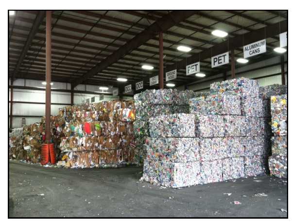
12,000 tons of recyclable materials are processed at the plant each month.